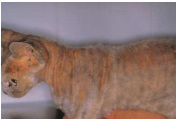
Figure 4. Same cat as Figs 2 and 3: Greasy, seborrhoeic, erosive dermatitis with hypotrichosis on the dorsum and head.