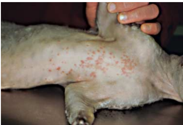
Figure 5. Case 4: Erythematous papules on the thorax.