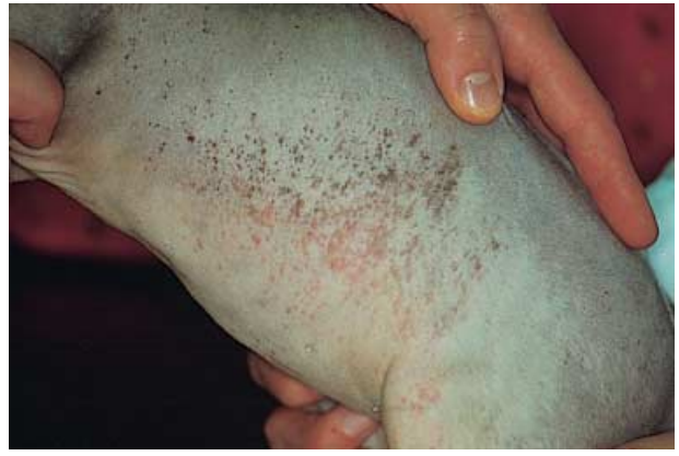
Figure 6. Case 5. Erythematous papules and hyperpigmented macules on the flank.