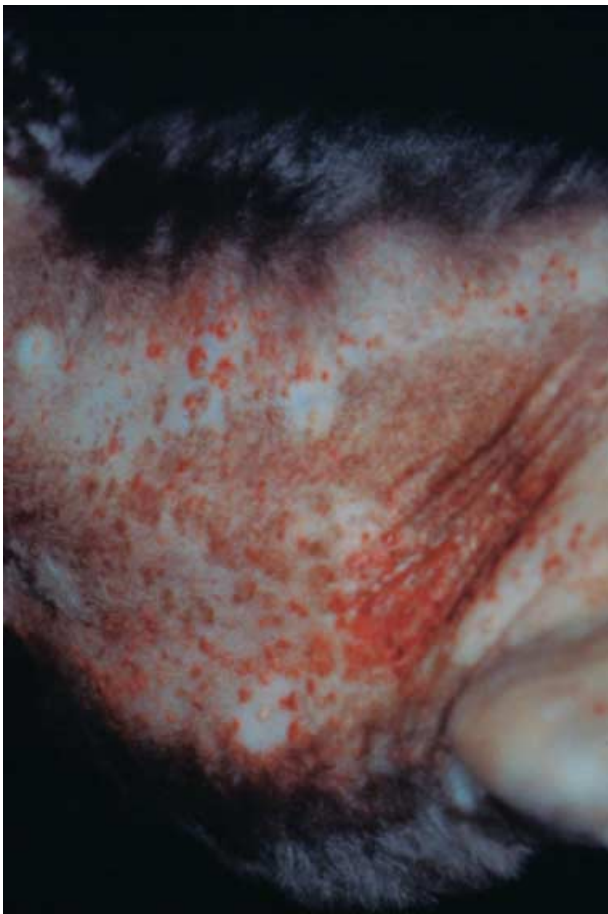
Figure 1. Case 1: Multiple erythematous, crusted coalescing papules on the abdomen and groin.

F: female; M: male; N: neutered; w: weeks; m: months; y: years.