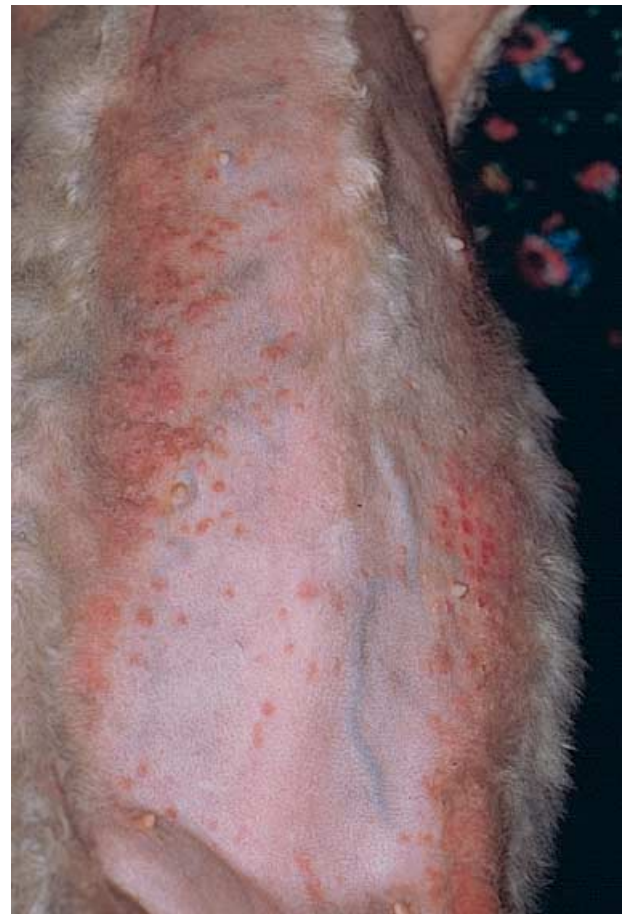
Figure 2. Case 3: Bilaterally symmetrical, linear papular eruption on the thorax and abdomen.

Dermatological examination revealed similar lesions in all cats. In Case 1, there were multiple, erythematous, coalescing, crusted and hyperpigmented papules on the abdomen, groin and ventral neck (Fig. 1) and an erythematous, exudative, raised plaque on the abdomen, which was clinically suggestive of an eosinophilic plaque. Case 2 showed multiple, erythematous, exudative or crusted and partly hyperpigmented coalescing papules arranged in a bilateral, linear distribution on the ventral lateral thorax and abdomen. In Case 3, a bilaterally symmetrical linear papular eruption on the thorax and abdomen and a greasy, seborrhoeic, erosive