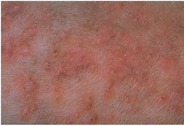
Figure 3. Same cat as Fig. 2: the skin lesions are represented by small erythematous papules, occasionally covered by tiny crusts.